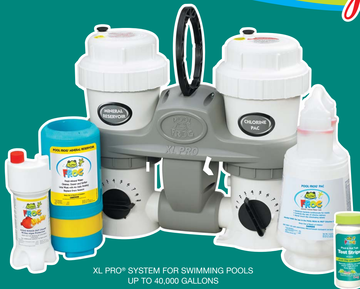
XL PRO® SYSTEM FOR SWIMMING POOLS UP TO 40,000 GALLONS

Cleaner, Clearer, Softer. It's Easier too!