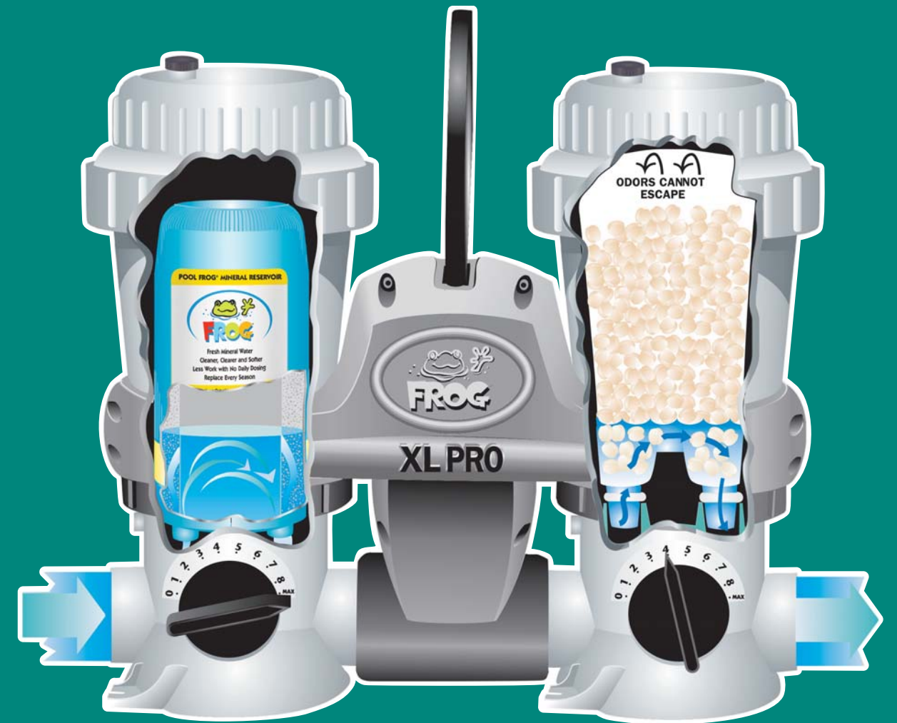
Set Mineral Cyclor to Max